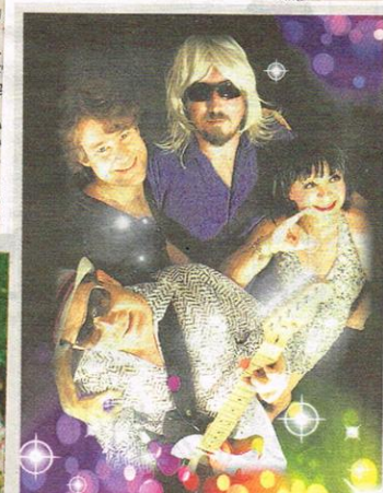
Groovin' on a Friday night at the Harwood Hotel with 4 Way Street - what could be better than that?