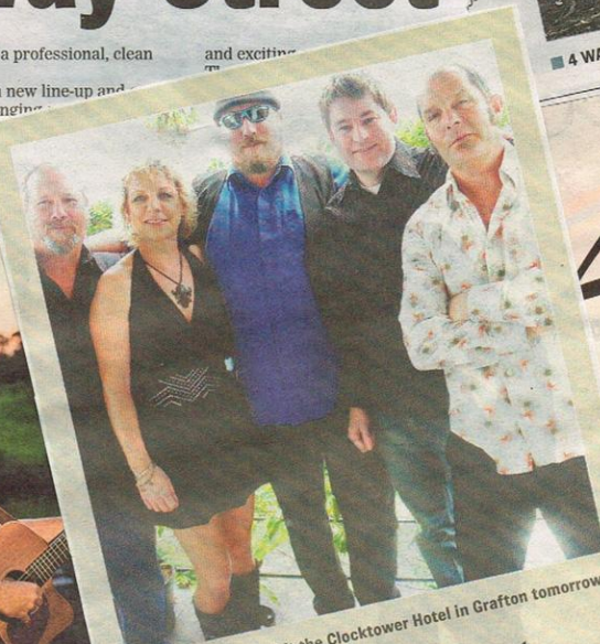
4 Way Street will hit the Clocktower Hotel in Grafton tomorrow night.

...a fun night or just hang around... Street Acoustica