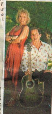
4 Way Street will play at the Maclean Services Club