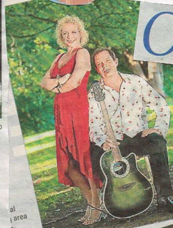
4 WAY STREET: In Maclean the

FREE deckside music 3:00-6:00pm featuring sounds of 4 WAY STREET ACOUSTIC Enjoy a 'Cocktail Special', game of snooker and